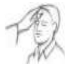
Ash Wednesday Feb. 17th