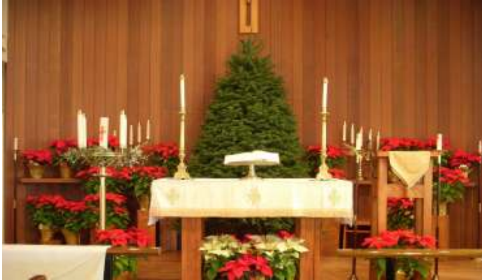
Our beautiful Altar for Christmas