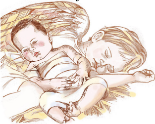
Luke 1:35, NRSV

"The child to be born will be holy; he will be called Son of God."